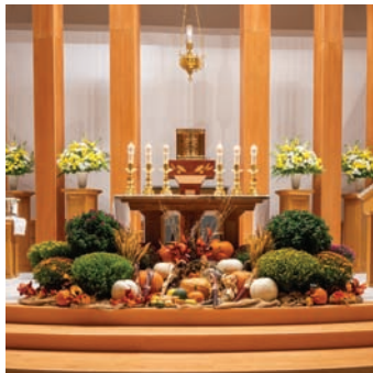
Thanksgiving Day Mass Monday, October 11 9 AM