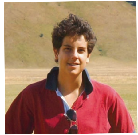
The Young Man that inspired our Eucharistic Miracles Exhibit