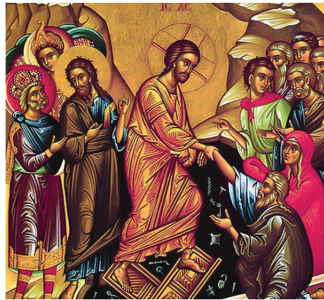
Death: Both a Tragedy and a Blessing