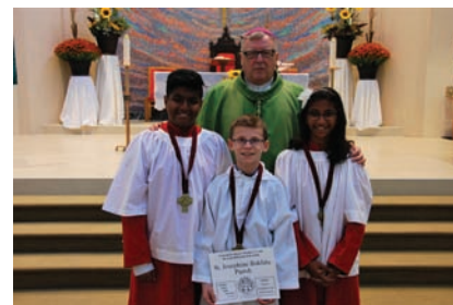
Congratulations to our Altar Server Awardees!

If you also wish to donate poinsettia to decorate our sanctuary this Christmas, please see the Squires. Thank you.