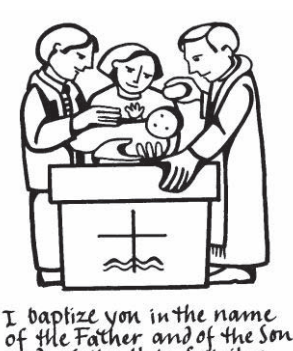
I baptize you in the name of the Father and of the Son and of the Holy Spirit